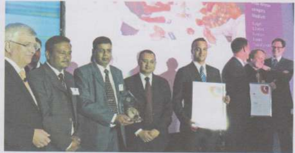
UCEP Nepal team with Dr. Grau receiving awards.

The project imparted vocational training to 412 youths; 38% were girls. 85% of the training graduates were placed in jobs initially while the final project evaluation study in 2012 sited 73% of them were still employed with an average salary of NRs. 5,500/month. Moreover, 5% of the graduates are self-employed with their own businesses with incomes in excess of NRs. 12,000 a month. They have indeed become role models in their families and societies – the ultimate aim of the project. The project stood out from applications of excellent projects around the world. Rigorous assessment process was conducted including