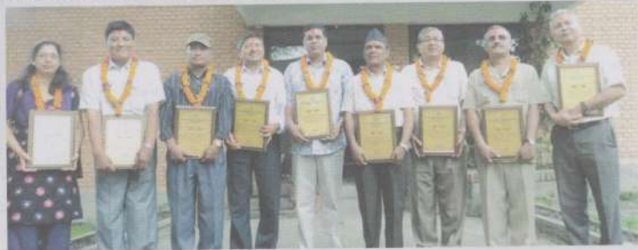
New elected Executive Board.