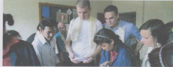
Finish delegations observing training.

A team of young politicians from Finland visited UCEP Nepal with the objective to learn about the impact of Finish government's support to Nepal. The team learned about Embassy of Finland supported project for youths from highly marginalized communities. Keenly interested young politicians visited the trades - the project site where the marginalized youths were provided vocational training on different occupations. The delegates also had interaction with