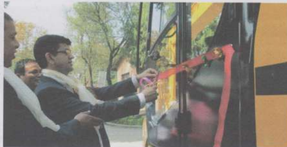
Chief Guest Inaugurating Excavator.