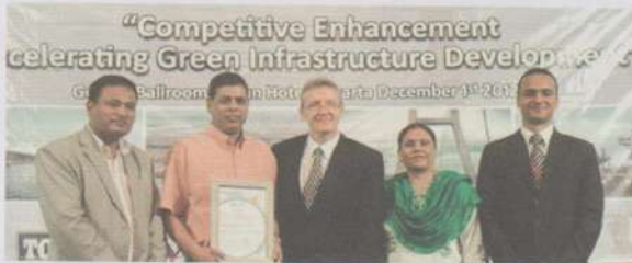
UCEP Nepal team receiving APFPM award.