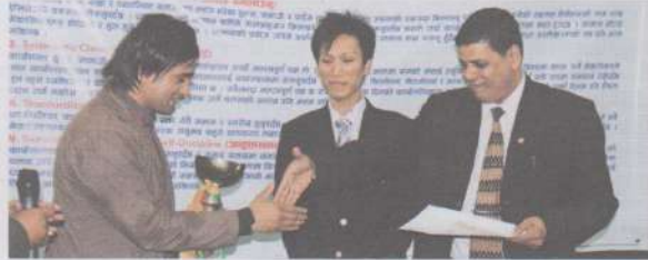
Plumbing trade receiving 5 'S' award.