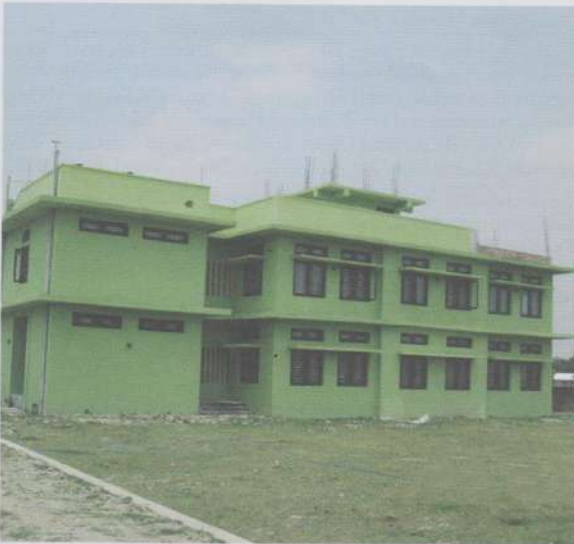
Juvenile Correction Home, Biratnagar.

Juvenile Correction Home is now in operation in Eastern region from July 17, 2013. 37 children from Eastern Development Region were transferred to the new correctional facility at Biratnagar, Morang. The home caters correctional services for children in conflict with law who permanently reside or whose cases are from Eastern Development Region of Nepal. Before its operation children from the region were sent to correction home in Bhaktapur, making it difficult for children to be in contact with their family regularly which is important for their successful reintegration. However, the other facility in the Sarangkot, Kaski caters services from children from Western, Mid Western and Far Western development regions of Nepal.