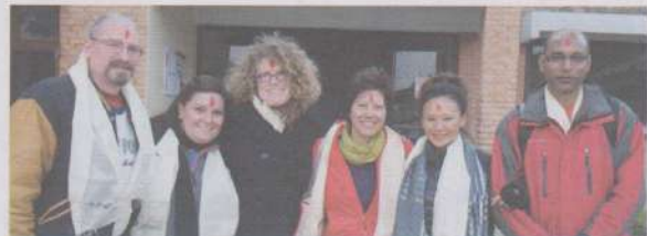
Team Friends in Service.

universal themes like self acceptance, intentions, gratitude, dreams, positive thinking etc. It was very effective in active participation of the children and in boosting their morale. UCEP Nepal team and fellow participants have admired the unconditional support from them.