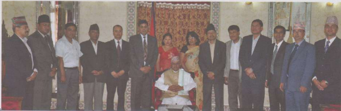
Rt. Hon'ble President Dr. Ram Baran Yadav with UCEP Nepal Executive Board.