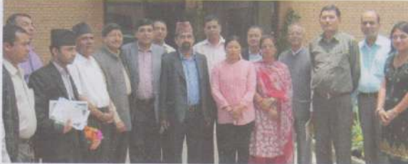
Hon'ble Minister and Secretary with Executive Board and senior staff members.