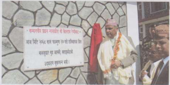
Hon'ble Chief Justice inaugurating the Juvenile Correctional Home in Pokhara.

UCEP Nepal has been entrusted to manage the home in cooperation with government authorities and like-minded organizations that are working for the child right sector in general and juvenile delinquents' right in particular.