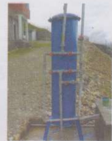
Newly installed water purifier.

Two water treatment plants were installed at Juvenile Correction Home Bhaktapur for safe and sufficient water supply to the children residing. This has significantly reduced water borne diseases especially skin and stomach related. Around 130 youths have been benefiting from this.