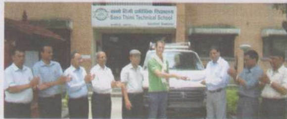
Land Cruiser for training purpose.