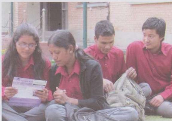
Trainees exchanging ideas and experiences of the training.

UCEP Nepal implemented this project in partnership with Save the Children International Nepal from 2007 to 2011. At the end of the project, an external party NEAT was given the responsibility of evaluating the project.