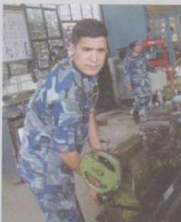
Career in Armed Police Force