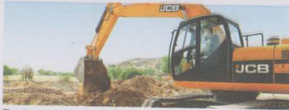
Trainee operating the JCB Excavator.

Operator's Training Center for JCB Heavy Equipment Backhoe loader commenced training from January 2010 in partnership with Morang Auto Works Pvt. Ltd. Approaching the completion of 2 years of implementing this training, the OTC has been able to produce 267 trained human resources after 14 training batches. Job placement for this training has been over 90 per cent while 40 per cent have been employed abroad. To upgrade the knowledge and skills of the graduates and eager learners, one week crash course on Excavator operation was started with 30 trainees and currently the second batch is under training. The skill of operating excavator will provide greater scope of job placement.