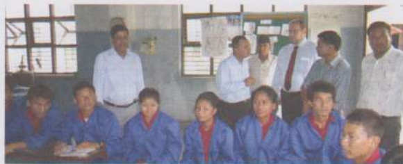
H. E. the Ambassador of Finland, Mr. Asko Luukkainen with the trainees.

Project agreement was signed on December 29, 2011 for 14 months. Its quantitative target is 122 youths. In first phase, 57 youths enrolled in training and 46 of them have completed their 6 months training on July 2012, 11 of one year's course are in their training. Similarly, 65 trainees for next session have joined training for 6 months course. This program has been very much instrumental to the organization to reach to the neediest youths from highly marginalized communities.